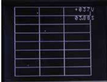
View of screen showing plotted oil drops.